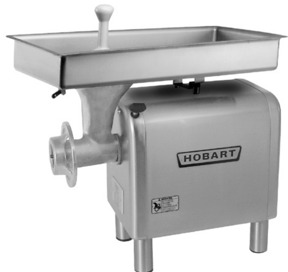
4822 with Optional Funnel Shaped Cylinder