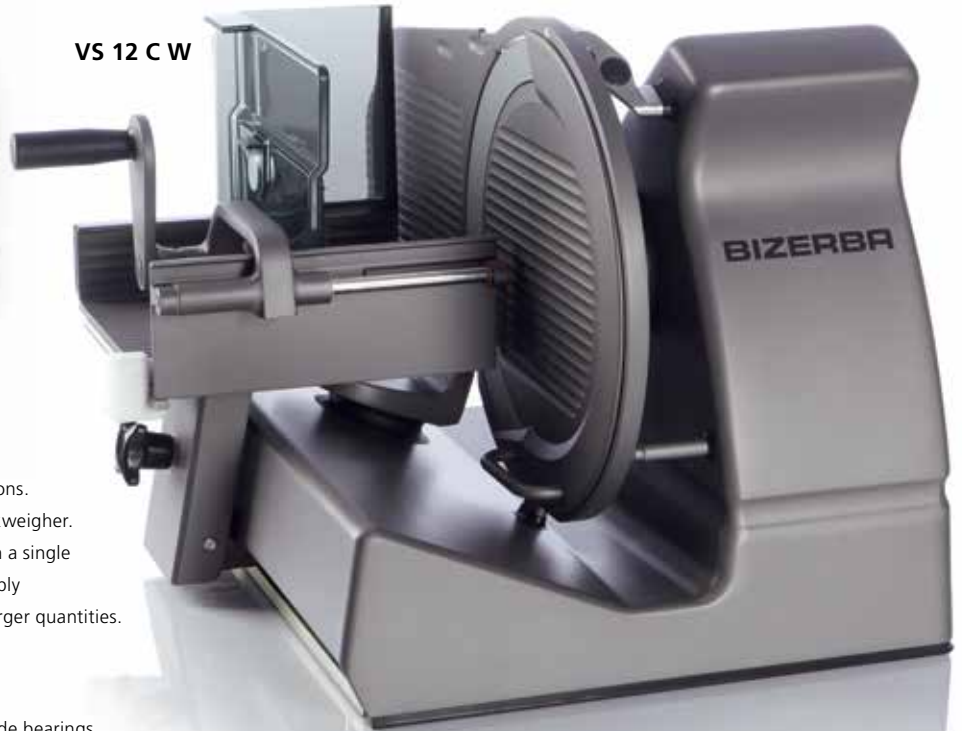
VS 12 C W

The deli slicer VS 12 offers a multitude of applications. In addition, the VS 12 W provides you with a checkweigher. The product can be perfectly sliced and weighed in a single working step. This accelerates operation considerably and increase sales of specific products by selling larger quantities.