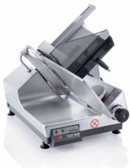
GSP HD 25°