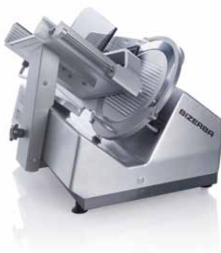
GSP HD 18°