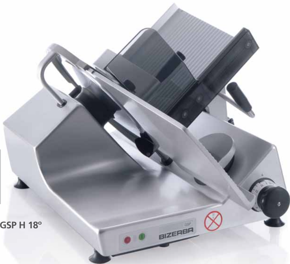
GSP H 18°