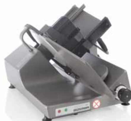
GSP H 18°