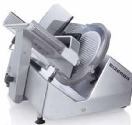
GSP H 18°