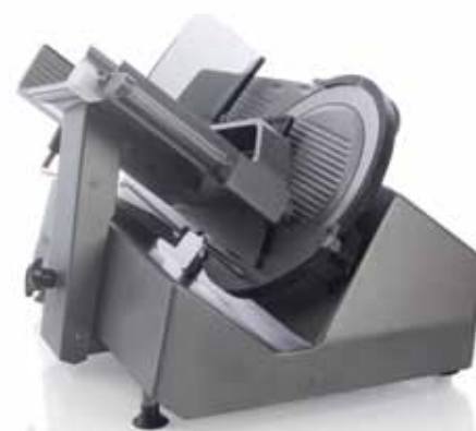
GSP HD 18°