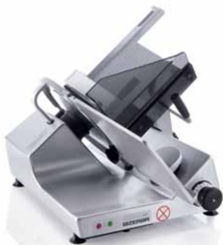
GSP H 25°