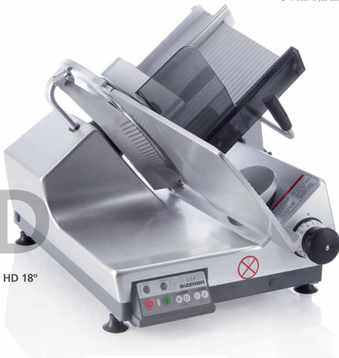
GSP HD 18°