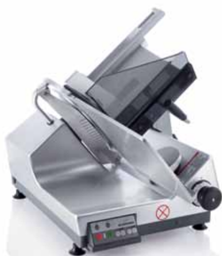
GSP HD 25°