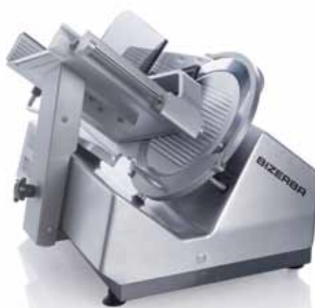
GSP HD 18°