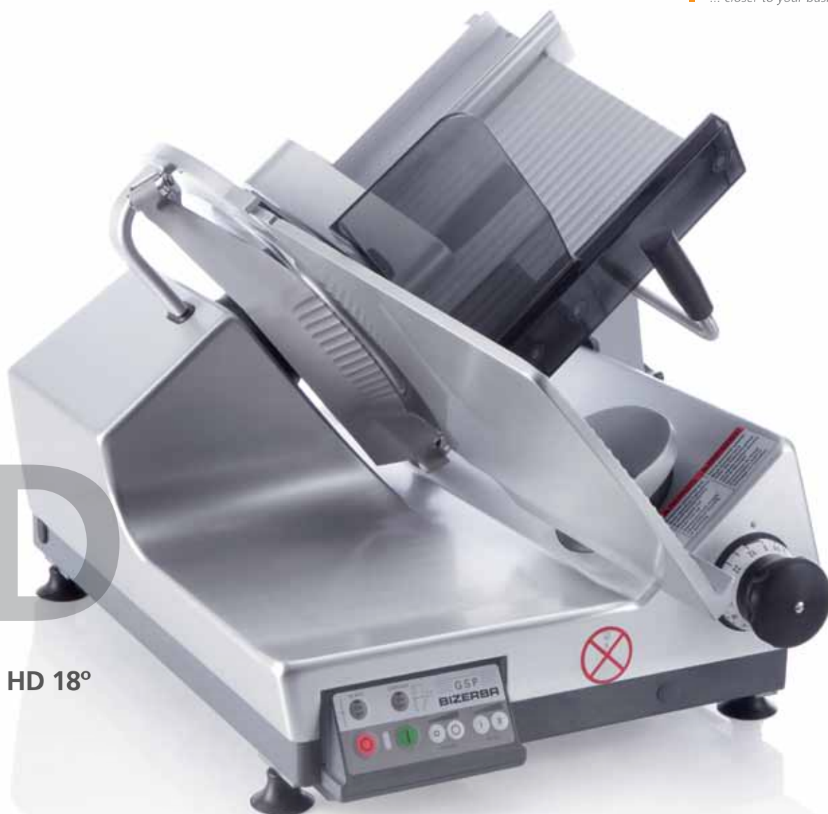
GSP HD 18°