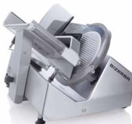
GSP H 18°