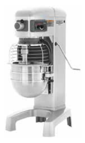
Model HL300 30 qt (28 l) bowl capacity