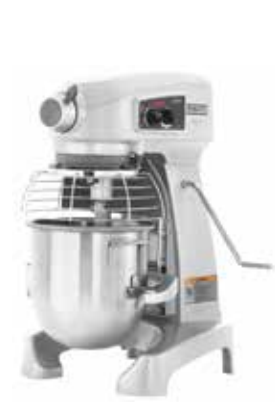
Model HL200 20 qt (19 l) bowl capacity