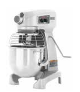
Model HL120 12 qt (11 l) bowl capacity