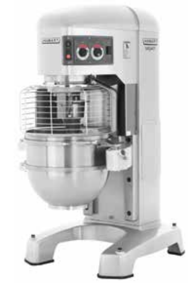
Model HL800 80 qt (76 l) bowl capacity