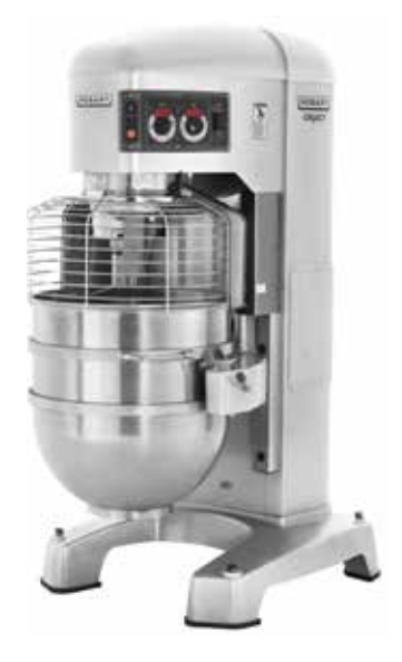
Model HL1400 140 qt (133 l) bowl capacity 02 | 03