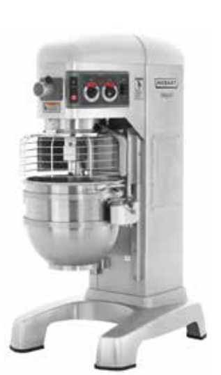
Model HL600 60 qt (57 l) bowl capacity