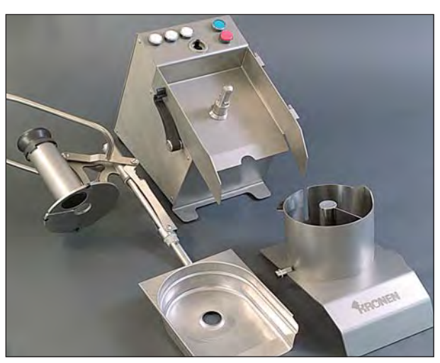
Completely made of stainless steel Every part that comes into contact with food is individually removable and dishwasher proof.