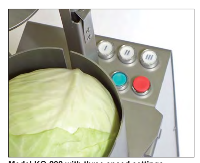
Model KG-203 with three speed settings: 250 – 350 – 450 r.p.m. because you need to cut fruit slowly, crisp cabbage and other crudités require higher cutting speed. To get perfect results everytime.