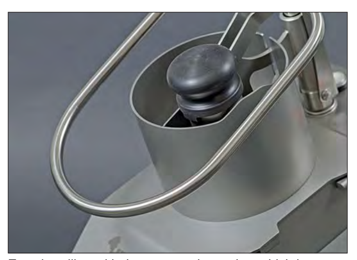
Easy handling with the ergonomic pusher which is suitable for the right- and left-handed users.